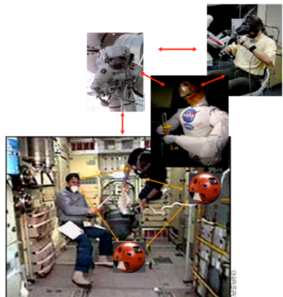
Figure 2. Human-Robot Teamwork on the ISS

To the extent we can adjust agent autonomy with reasonable dynamism (ideally allowing fine-grained handoffs of control to occur “anytime”) and with a useful range of levels, our teamwork mechanism can flexibly renegotiate roles and tasks among the human and robotic agents as needed when new opportunities arise or when breakdowns occur. It is important to note that the need for adjustments may cascade in complex fashion: interaction may be spread across many potentially distributed agents and humans who act in multiple-connected interaction loops. For this reason, in problems of realistic scale, adjustable autonomy may involve not merely a simple shift in roles among a human-agent pair, but rather the distribution of dynamic demands across many coordinated actors.