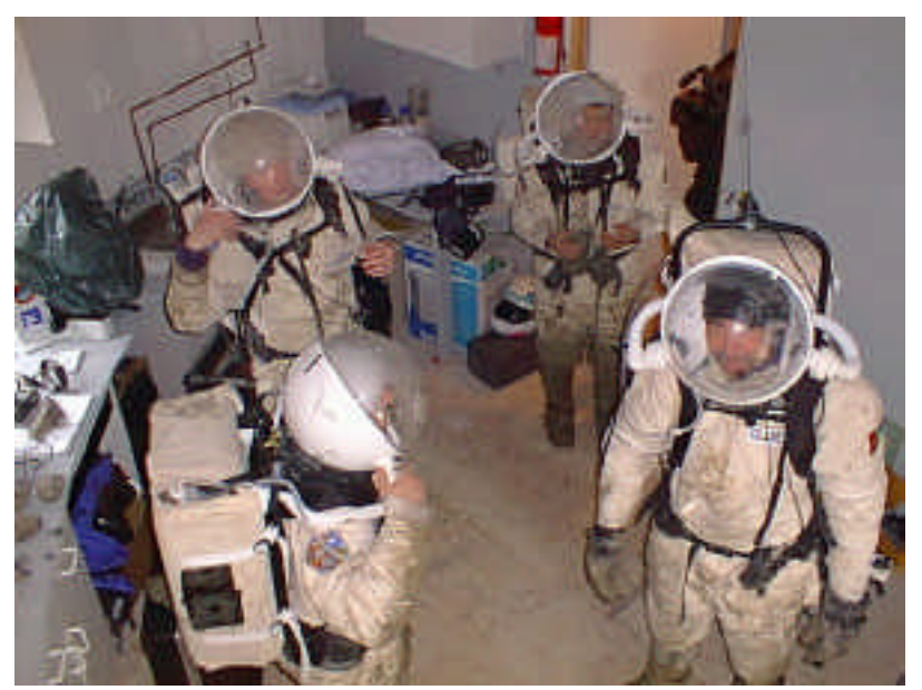
Figure 2. The activity of waiting in the EVA Prep Room for assistance to remove the suits.

Another striking example of a goal involving stable self-regulation (Iran-Nejad 1988) is waiting for someone or something to happen. Examples include waiting in the EVA Prep Room for assistance to remove the suit (Figure 2) and waiting while sitting at the mess table for other people to arrive at the debriefing meeting.