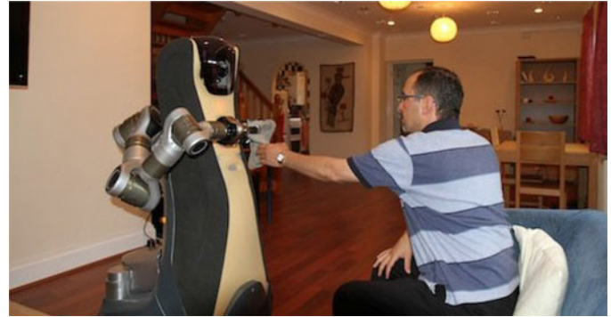
Fig. 1. Care-O-bot robotic assistant operating in the University of Hertfordshire’s Robot House.

Verification is the process of assessing whether a system meets its requirements; formal verification is the application of formal (i.e., mathematical) methods to the verification of systems. The formal verification approach used in this paper is based on model checking [1], in which a model of a program or process is constructed. This model is typically nondeterministic so that each “run” (or simulation) of the model can be different from the last. A program called a model checker exhaustively analyzes all possible executions of the model in order to establish that some property, usually derived from system requirements, holds. Therefore, it is possible, for example, to use a model checker to formally verify that in every execution of a given program, the program will always reach a desirable situation. In other words, we can formally verify that a given requirement holds.