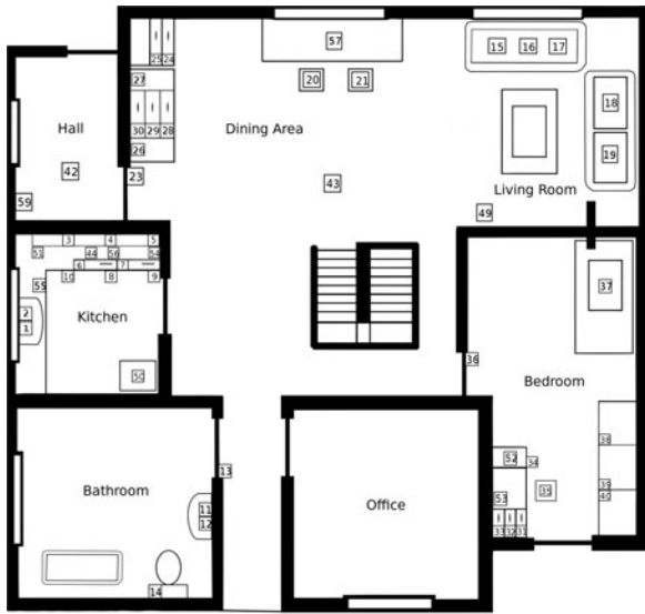
Fig. 2. Plan view of the ground floor of the University of Hertfordshire Robot House. Numbered boxes show the locations of sensors.

Therefore, encoding these autonomous systems using Brahms reduced modeling errors due to changes in abstraction level.